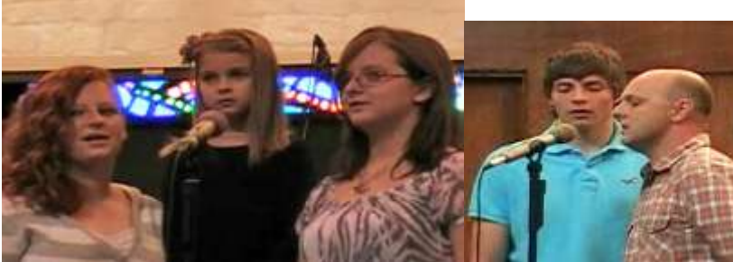
Our Youth Group performing all on stage at the same time.

Make a joyful noise unto God, all ye lands: Sing forth the honor of his name: make his praise glorious. (Psalms 66:1-2)